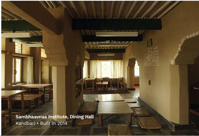
Sambhaavnaa Institute, Dining Hall Kandbari • Built in 2014